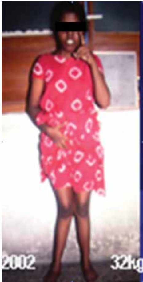
Fig. 2 : Patient of celiac disease presenting with genu valgum.