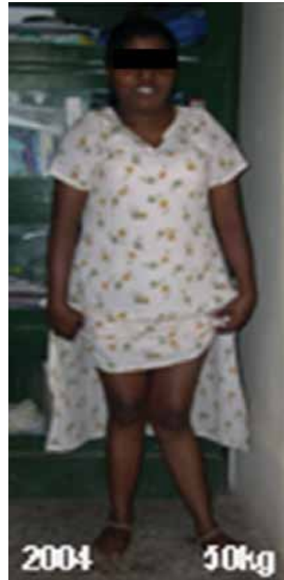
Fig. 3 : Same Patient on gluten free diet with significant weight gain.

Celiac disease, in the absence of typical symptoms is often an under diagnosed entity. In selected patients, presenting with intractable epilepsy, diagnosis of Celiac Disease should be considered even in the absence of GI symptoms. Gluten free diet if constituted early can be effective in reversing neurological symptoms. Presence of iron deficiency anaemia and features of metabolic bone disease along with intractable seizures make the diagnosis of celiac disease likely. Iron deficiency anaemia and metabolic bone disease respond to gluten free diet rather than just calcium and vitamin D supplementation. Diagnosis of celiac disease is often challenging and a clinician should be vigilant of the same due to its varied extraintestinal manifestations.