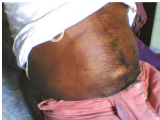
Fig. 1 : Patients with abdominal swelling